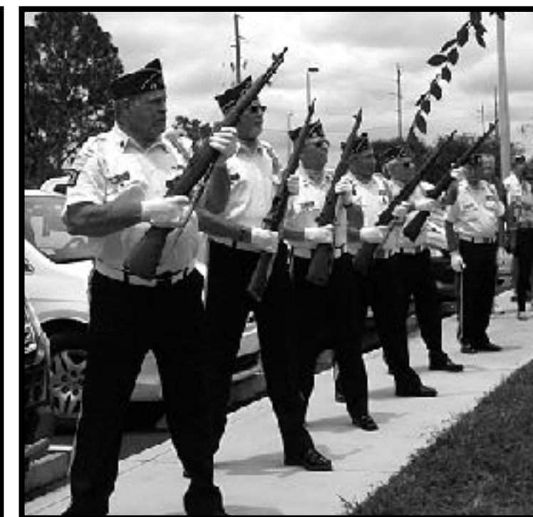
Post 318 Memorial Day 2018